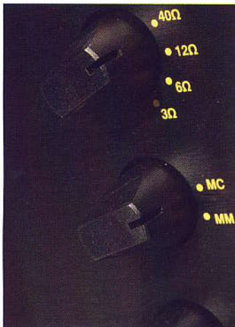
ABOVE: Note the m-c/m-m option control

Just under £5k is a bagful of shekels, but this should be a prime contender for everyone who 1) loves valves, 2) uses their turntable more than any other source, and 3) doesn't want to buy another pre-amp in the foreseeable future. This thing has 'classic' written all over it. Now, Tim, how about a matching amp?