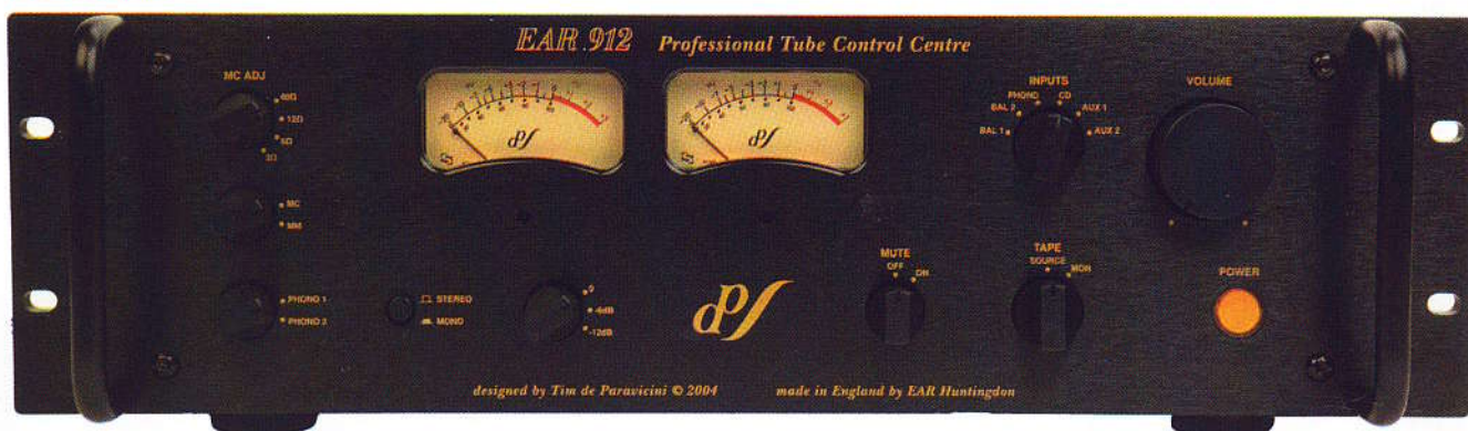
ABOVE: On the left hand side are the phono section controls; also note the mono/stereo button and the gain matching rotary control with three settings