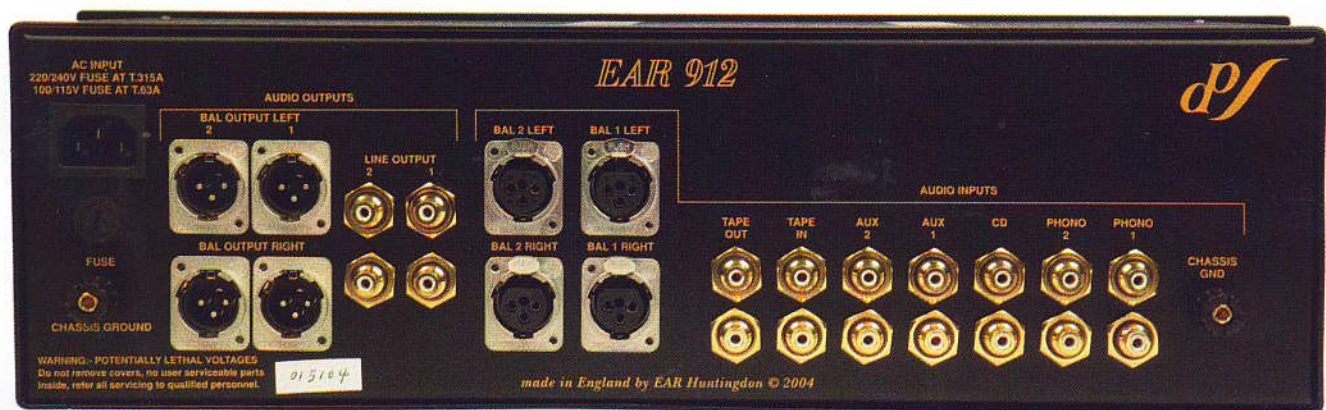
ABOVE: The back of the 912 features beefy connectors and two sets of balanced (XLR) and single-ended (RCA) outputs